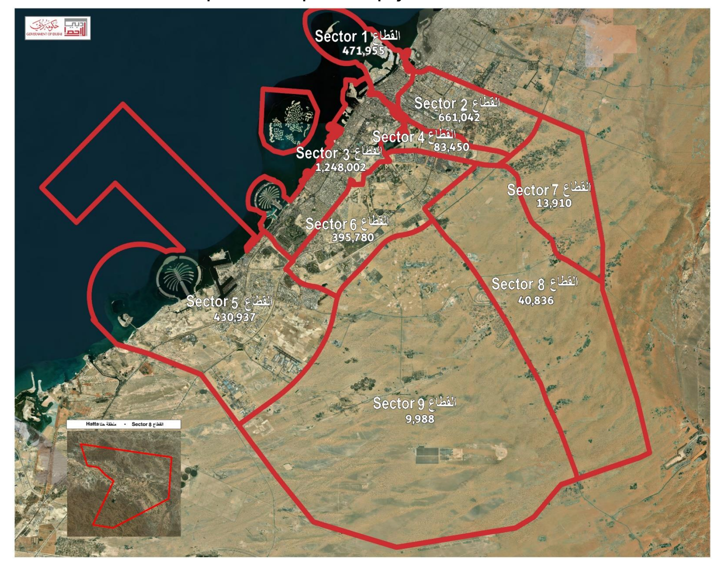
Graph 3 - Dubai Population Map by Sectors - End of 2019